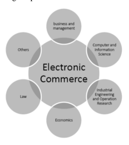
Fig.1. Electronic commerce articles and conventional academic fields.

Research on electronic commerce articles fell into seven categories: business and management; pc and data science; applied science and operation research; engineering; economics; law; et al. (see Figure 1). SCIE listed electronic commerce articles is completely different with those articles revealed within the SSCI in typical educational fields. Figure one shows that almost all analysis into electronic commerce was pc and data science familiarized, that contributed 71.99% of the SCIE-listed electronic commerce articles. The opposite articles were from the fields of commercial engineering and operation analysis, business and management, engineering, and others. Among the pc and data science field.